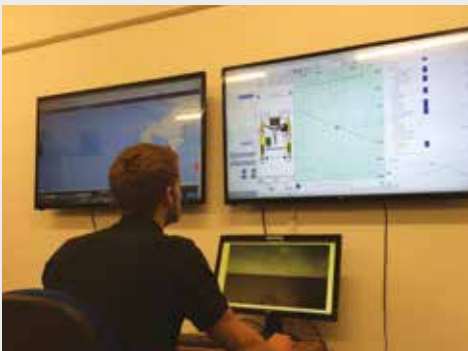
ASView-Bridge User Interface with on-board camera feedback