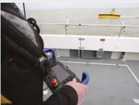
ASView-Helm for direct remote control